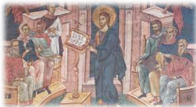
Our Lord teaches in the Synagogue at Nazareth

Follow us on Facebook at ‘St. Ambrose’s Church, Kidderminster’.